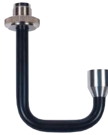
FIG 24 VACUUM ADAPTOR

Stainless steel adaptors available in various sizes of Metric, BSP and NPT thread. Dual gauge stand for simultaneous calibration of two instruments.