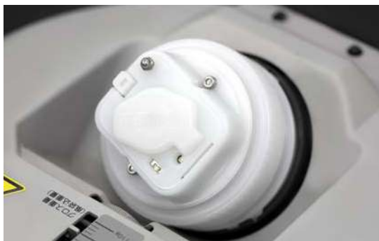
The picture taken with ARV-310P